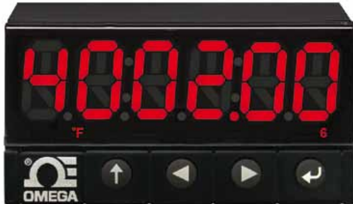
CN8EPt Series shown actual size.