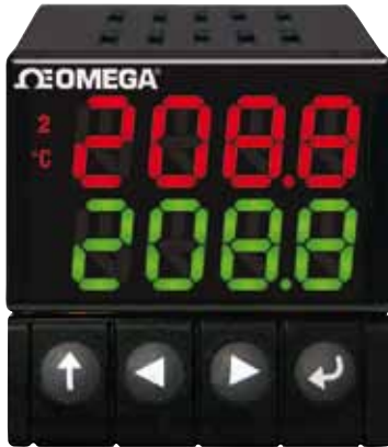
CN16DPT Series shown actual size.