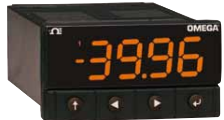
CN32Pt Series shown actual size.