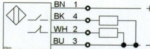
Diagram of Connections

** The protection class is complied with when the protection screw for the teach device is screwed in.