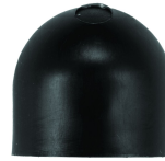
6LV1352 Light Shield Accessory for EK4036S, EK4436SM, K4000 Series Button Photocontrols