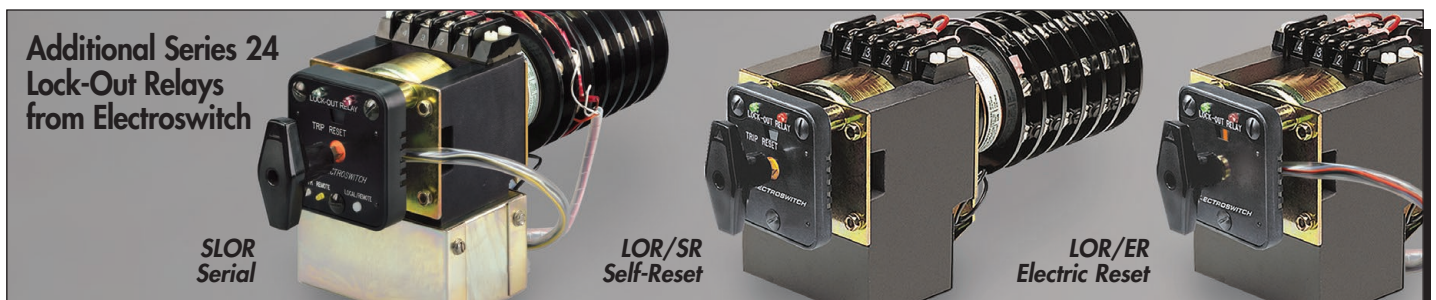
Additional Series 24 Lock-Out Relays from Electroswitch